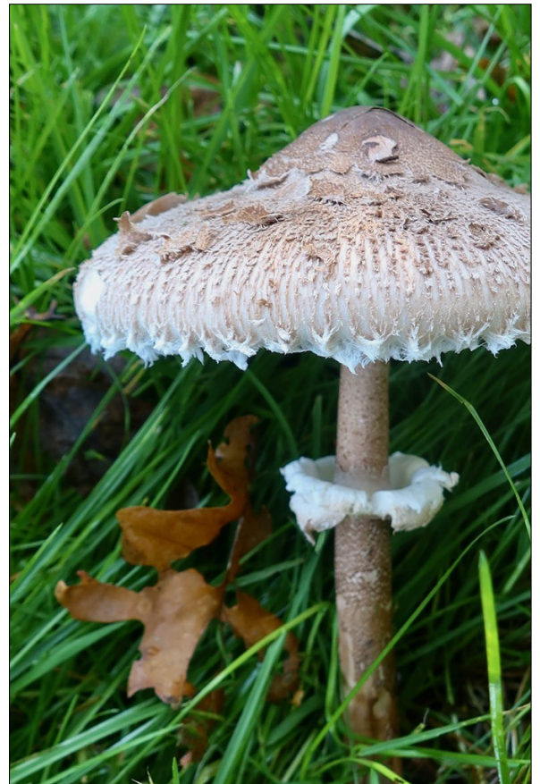
Right: Macrolepiota konradii with cap about 10 cms across (LS)

Our first find, Macrolepiota konradii (a species of Parasol), was standing proud in the long grass just as we set off. Somewhat similar to the more common M. procera (Parasol) also on today's list, it shares with that species the distinctive brown snakeskin markings on the stem with its movable ring but has a considerably less scaly cap, the scales mainly on the inner half with the outer half merely streaky fibrillose. There is debate amongst mycologists whether this species is in fact the same as M. mastoidea (Slender Parasol) which however has an abrupt nipple-like swelling in the cap centre. For me today's species looks distinctively different but time will tell which name should be applied.