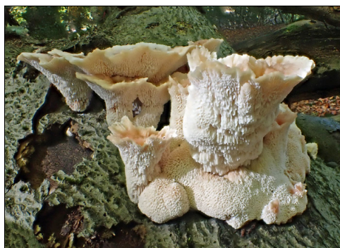
Left: two views of Abortiporus biennis fruiting abundantly on fallen Beech today. (Far left: LS; Left: NF)

Also on fallen Beech we were shown a corticioid species (one that grows flat on wood) which was a mystery to the BFG