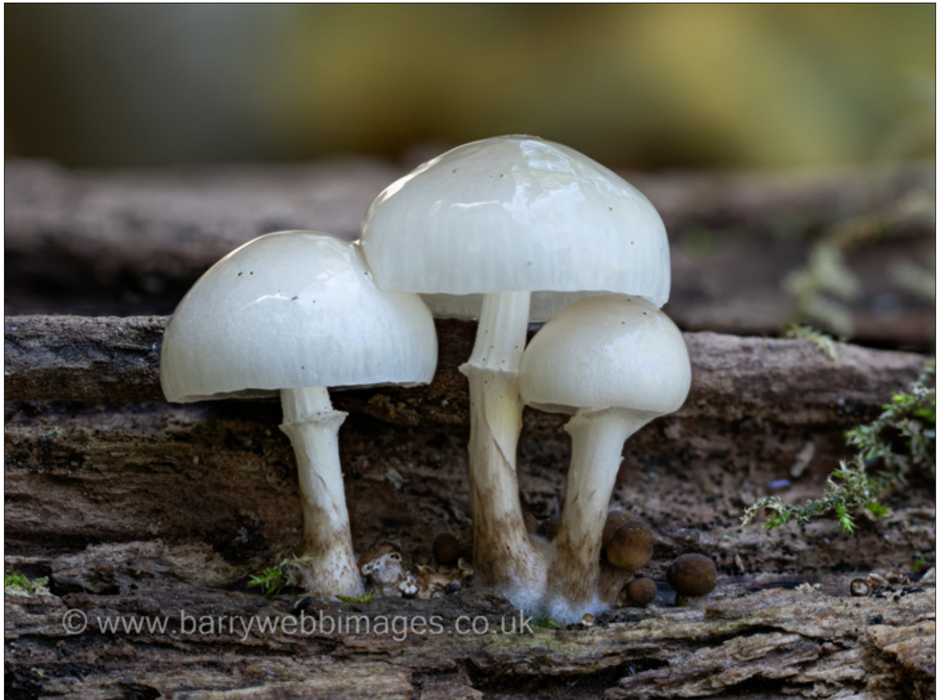
Above: a small cluster of young Mucidula mucida (Porcelain Fungus) (BW)