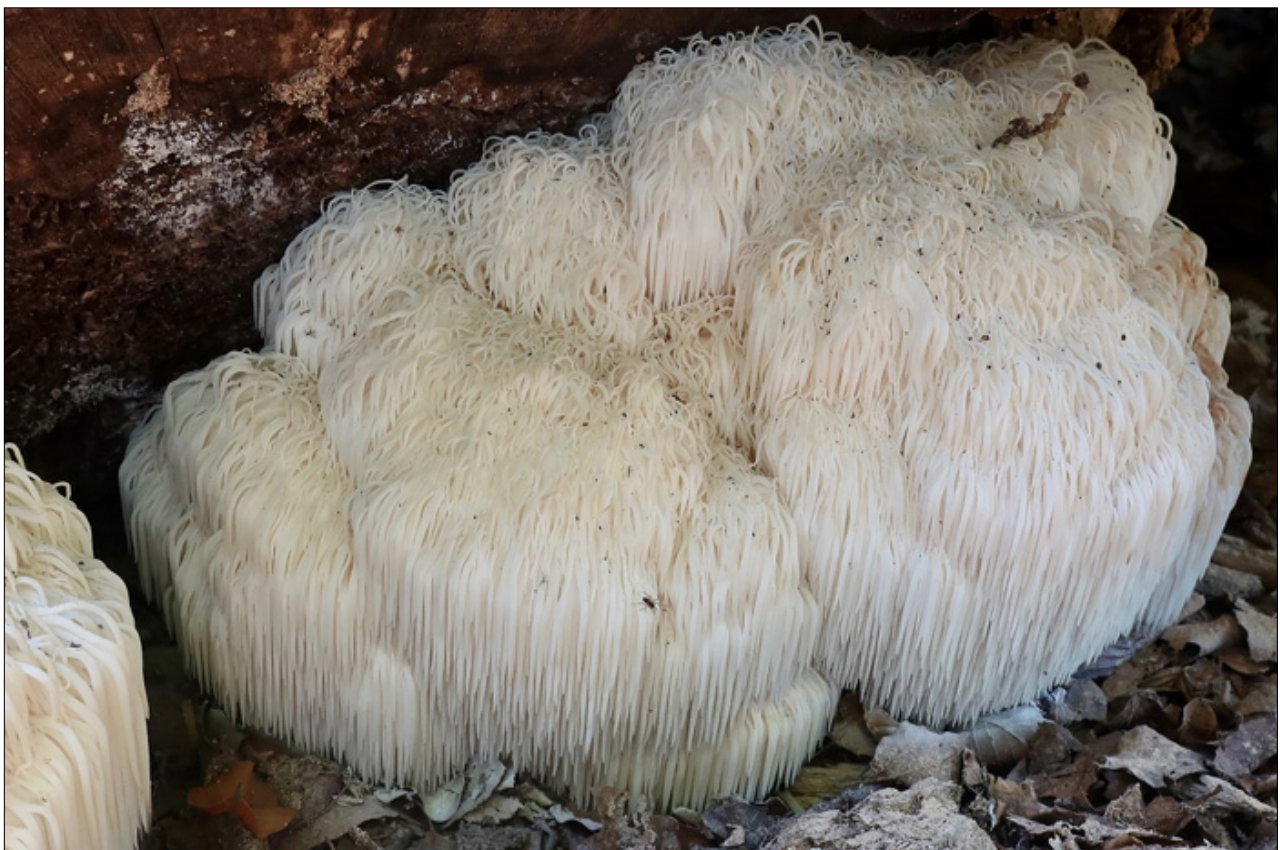
Below: three views of the magnificent Hericium erinaceus (LS and BW)