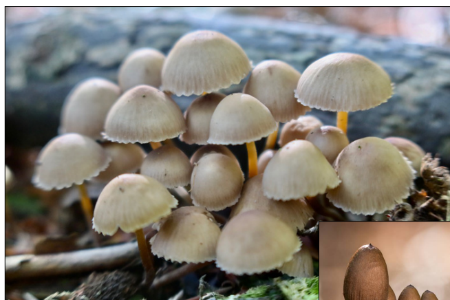
Above & right: Mycena inclinata , both mature (LS) and immature (BW) on an Oak log today.