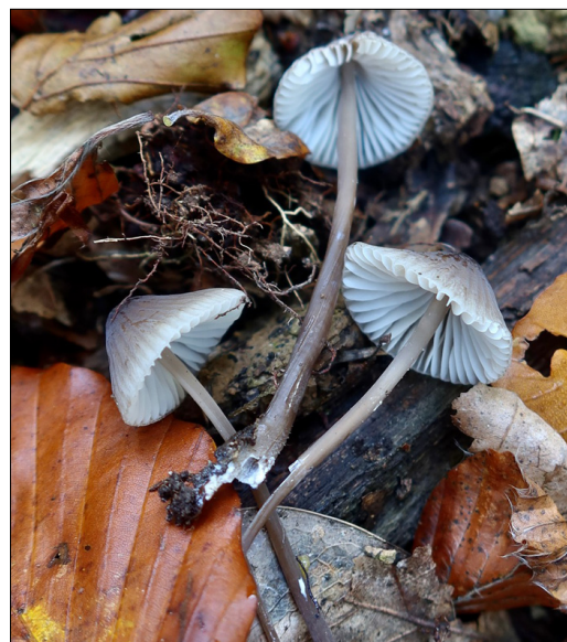
Right: Mycena galopus , the damaged stem bases showing their white 'milk'. (LS)

As we continued, many specimens of the genus Mycena (Bonnet) were handed in to me. This is a regular occurrence and I often spend several hours checking collections through with a microscope at home. We have 8 different Bonnets on today's list – quite a modest number for this time of year – and luckily several of these were recognisable in the field owing to some distinctive feature or other. Mycena galopus (Milking Bonnet) grows in woody litter and looks pretty well identical to many other Bonnets unless one spots that when damaged it uniquely leaks white milky fluid from the stem. We saw two other Bonnet species which also leak fluid in this way: M. crocata (Saffrondrop Bonnet) which has bright orange juice and M. haematopus (Burgundydrop Bonnet) which has brownish red juice. Both are common but are found on fallen wood rather than in litter. (Images of both species can be found via the Masterlist on our Members' Finds webpage.