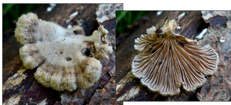
Above: The upper and lower surfaces of Schizophyllum commune , found fruiting on a fallen wood pile.

Piles of fallen wood are often a good place to look for interesting fungi and today was no exception. One of these was a small rather insignificant bracket-like species with gills. Schizophyllum commune (Splitgill) is common on this substrate in many parts of the world and has a rather hairy surface, distinctive forking gills and a frilly edge - features which make it an easy one to recognise.