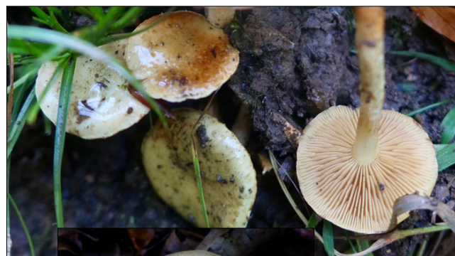
Right: Pholiota gummosa , the insert is of a mature cap about 5 cms across (LS)

In a rut in a muddy path I noticed an insignificant dirty greenish yellow species which tends to cause confusion over its identity. Pholiota gummosa (Sticky Scalycap) grows on tree roots or submerged wood and regularly appears apparently on soil at pathsides but lacks the typical obvious scales of the showier members of the genus and is also considerably smaller. The sticky caps are clearly visible here. Later I was handed a larger specimen on which the fine scales are visible.